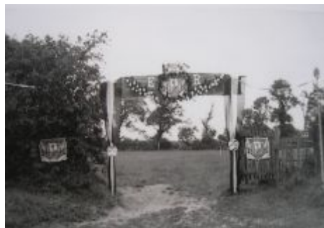
Entrance to the Sports Field...now Roberts and Firmount Close