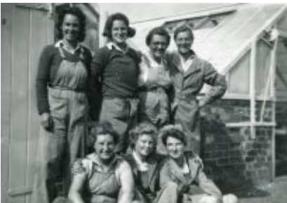
Land Army Girls at Ashley Road Nursery during WWII

For more information on the exhibitions and events, or to share information and memories contact the museum on 01590 676969