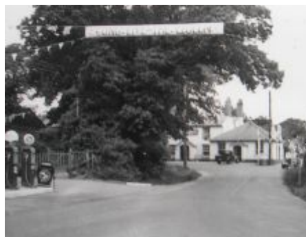
The Crown and Cedric Hackwell's Petrol Pumps