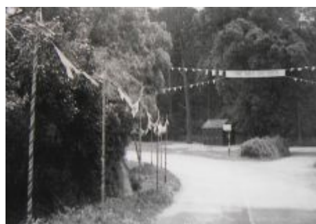
Everton Bus Shelter on the Green