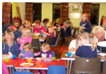
POSADA PARTY December 2013