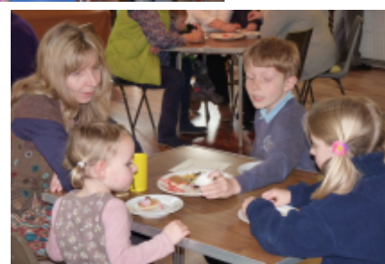
PANCAKE PARTY February 2014